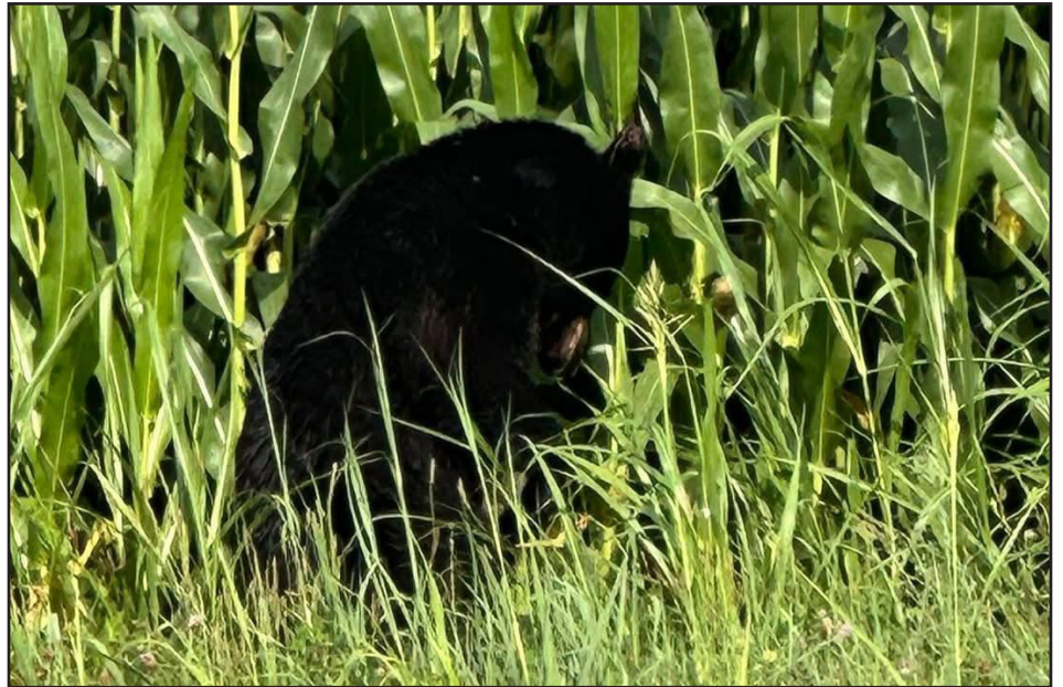
IN THE FIELD — Passersby on Highway 22 were surprised to see this bear at the edge of a corn field near the Henderson-Carroll line on Saturday.

More tips on coexisting with bears are available at bearwise.org