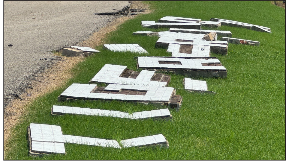
OLD LETTERING — The letters that once spelled 'Tiger Territory' across the front of the bleachers lay broken at the edge of the field.