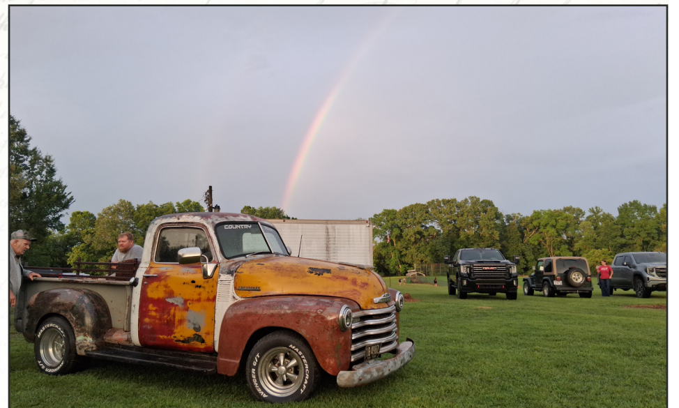
DOUBLE RAINBOW — A rainbow arcs over Tony Banks' Chevrolet truck.