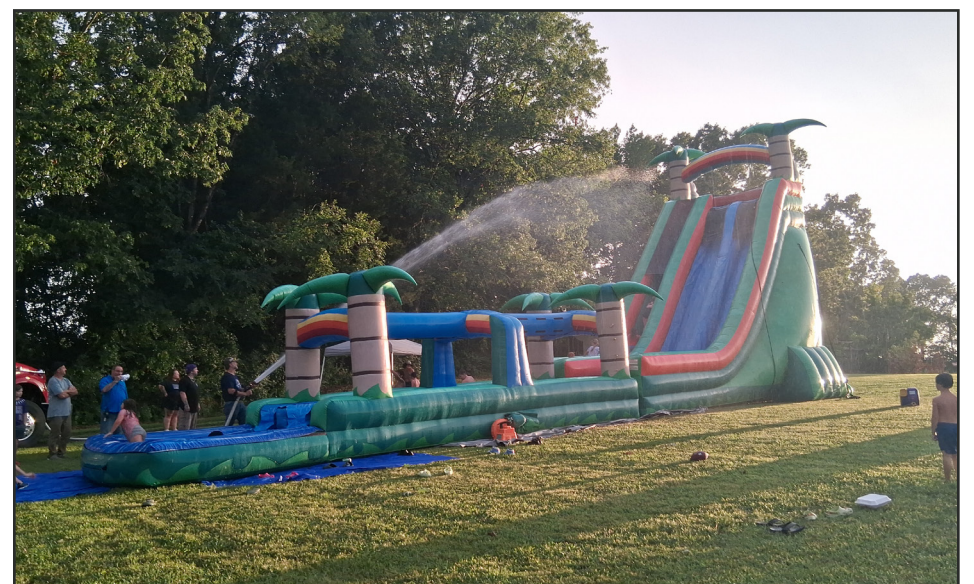
WATER FUN — Terry Volunteer Fire Department provides water for the waterslide, bypassing the need for a well.