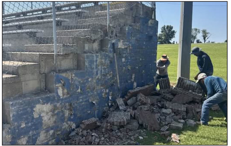
COMING DOWN — A crew with Graves and Graves Construction begins tearing down the brick facade on Central's home bleachers.

The board also accepted a separate bid Tuesday for upgrades at Central Elementary School, where crews will replace the ceiling and improve insulation in the gym.